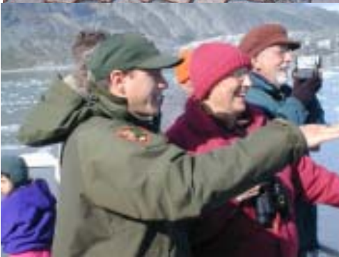
Rangers at Glacier Bay National Park & Preserve (top and bottom) and Klondike Gold Rush National Historical Park (center).